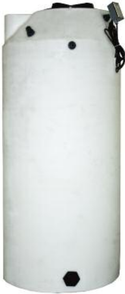
Polyethylene atmospheric storage tanks with float switch and bulkhead fittings installed.

Ideal for whole house and light commercial installations.