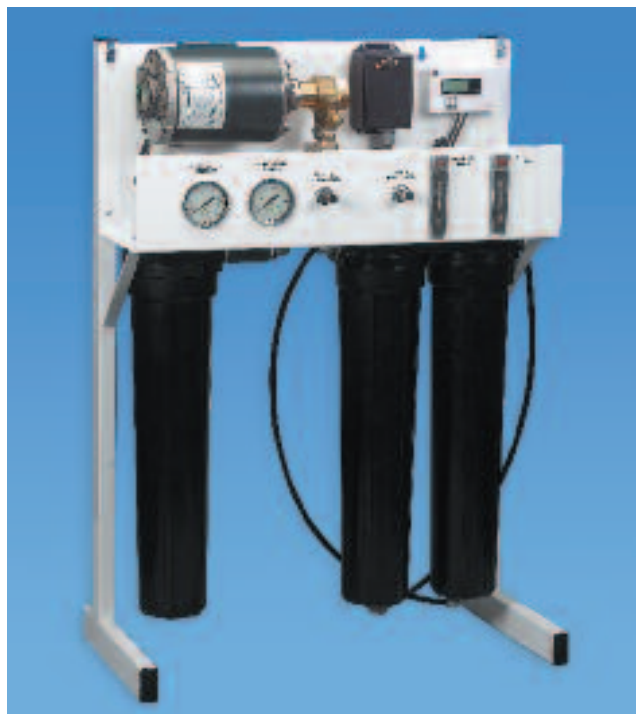
R-13 with optional stand