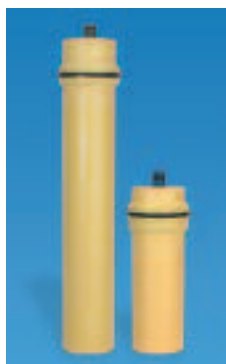
Proprietary Membranes (for R-13 systems)