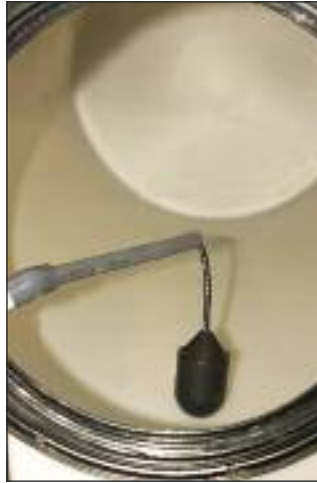
Pre Installed Float Switch.