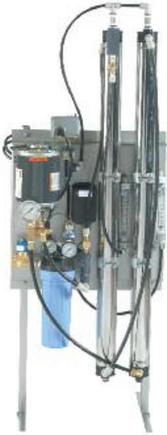
R12-1200-2 system with optional legs