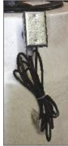
Junction box connects the float switch to RO system.