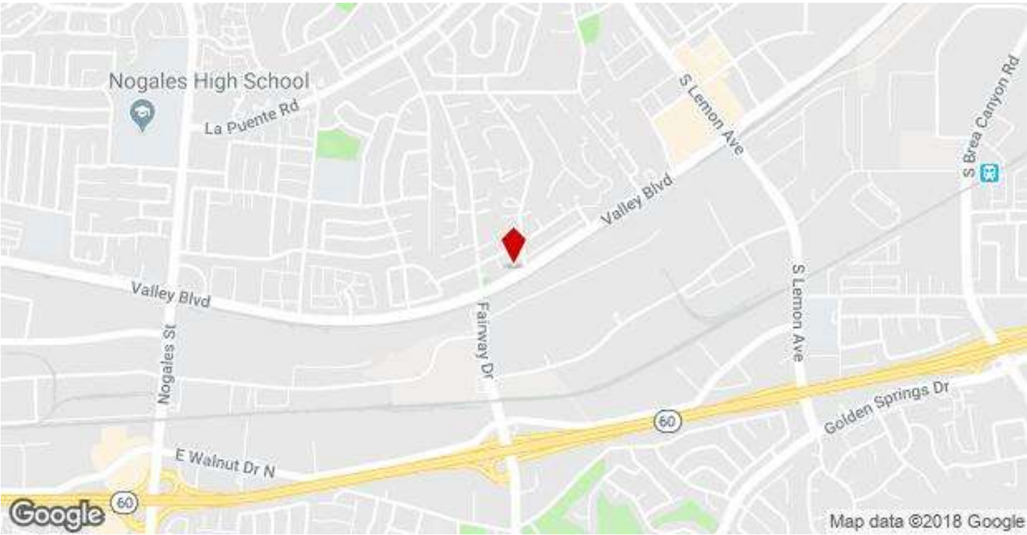
Map of 19759 Valley Blvd Walnut, CA 91789