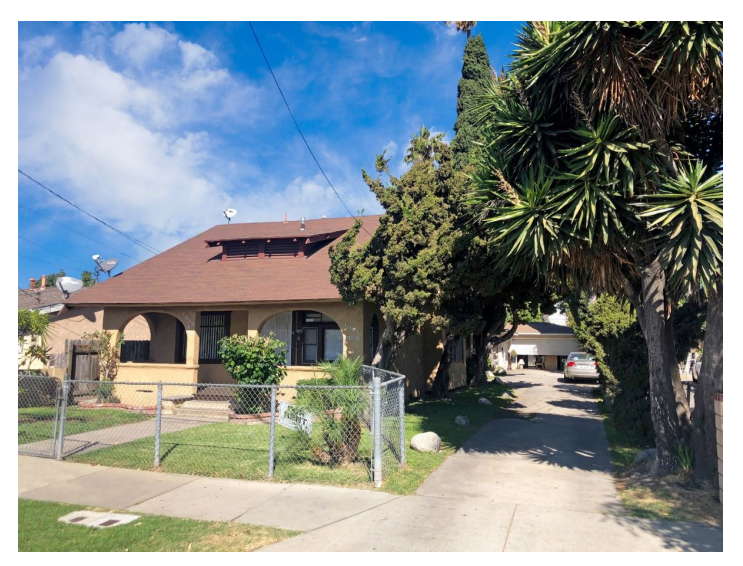
1033 Highland FULL