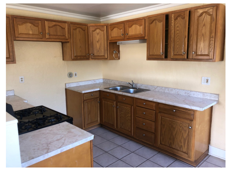
1033 Highland Unit A