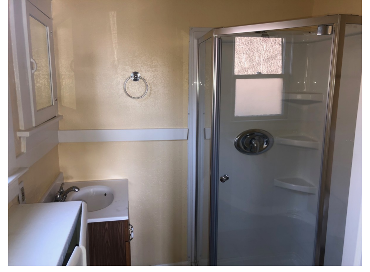
1033 Highland Unit A