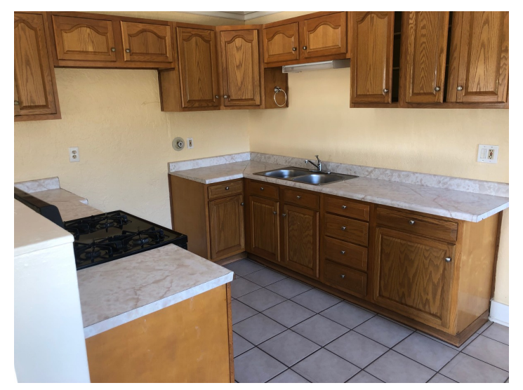
1033 Highland Unit A